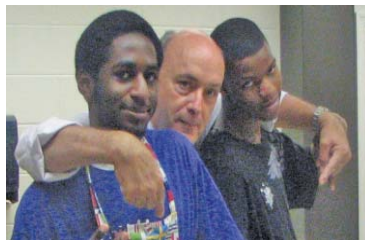
Mr. Fitch & CHS students prepare a "Breakfast for Cougar Champions."

return, acknowledging codes of conduct, bus conduct, parental responsibilities, computer use, and permission to publish student work, pictures/names. Update and return the yellow emergency procedures card , and the green clinic card .